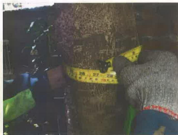
樹幹周長 69 cm，樹木直徑 21 cm ④ Perimeter of tree trunk 69cm, diameter of the tree 21cm