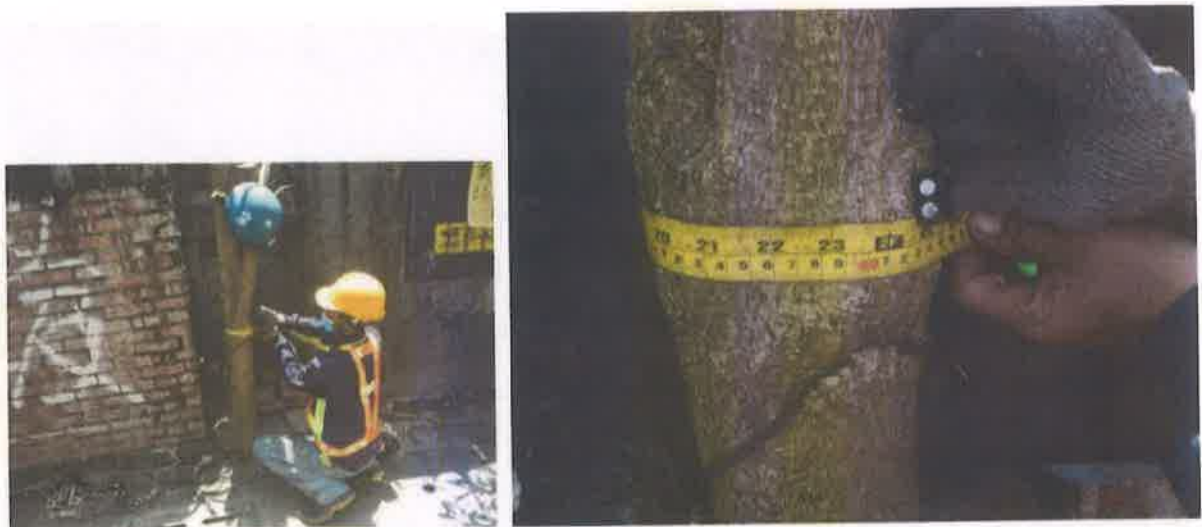
樹幹周長 62 cm，樹木直徑 19 cm 4 Perimeter of tree trunk 62cm, diameter of the tree 19cm