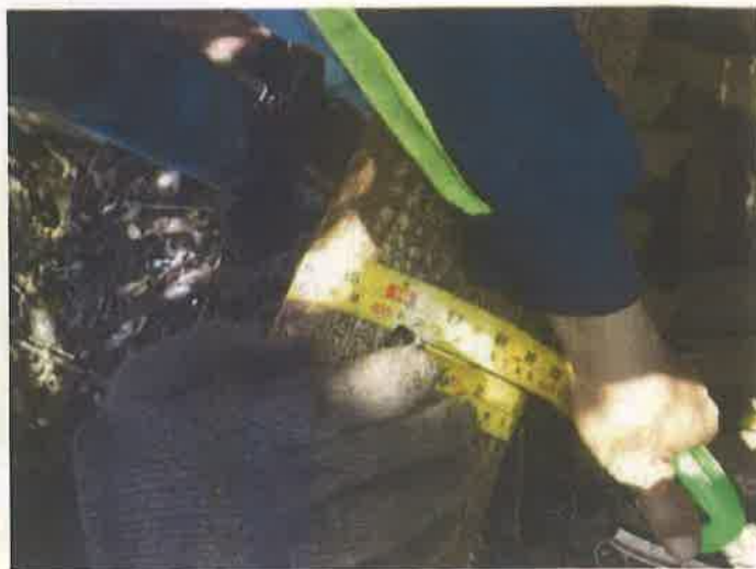
樹幹周長 41 cm，樹木直徑 13 cm ✓ Perimeter of tree trunk 41cm, diameter of the tree 13cm