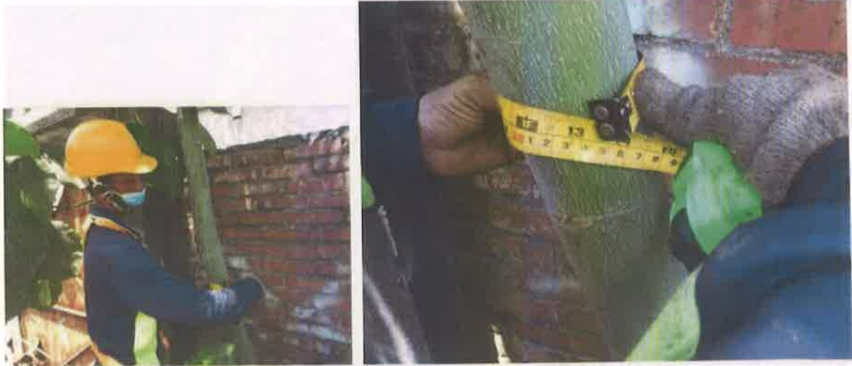
樹幹周長 34 cm，樹木直徑 10 cm 3 Perimeter of tree trunk 34cm, diameter of the tree 10cm