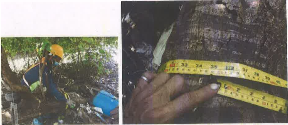
樹幹周長 89 cm，樹木直徑 28 cm ③ Perimeter of tree trunk 89cm, diameter of the tree 28cm