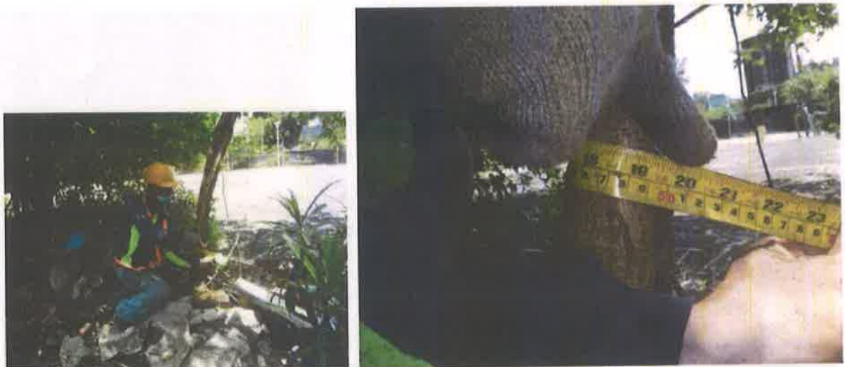
樹幹周長 49 cm，樹木直徑 15 cm Perimeter of tree trunk 49cm, diameter of the tree 15cm