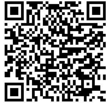
招標設定地上權 ITT for the establishment of superficies