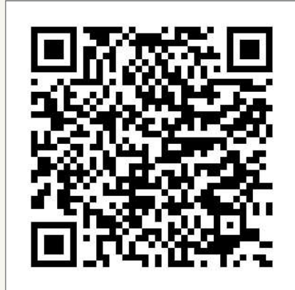
招標設定地上權 ITT for the establishment of superficies