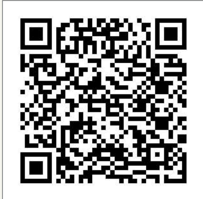
標售不動產 Sale of real estate by tender